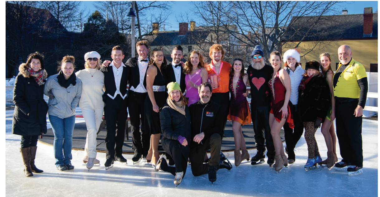
Skating with the Stars participants with Ice Dance International skaters at last year's event

Strawberry Banke has begun the process of re-examining the Sherburne House, re-assessing the 1960s preservation project and planning for its future. To learn more about the project, visit StrawberryBanke.org/Sherburne.cfm