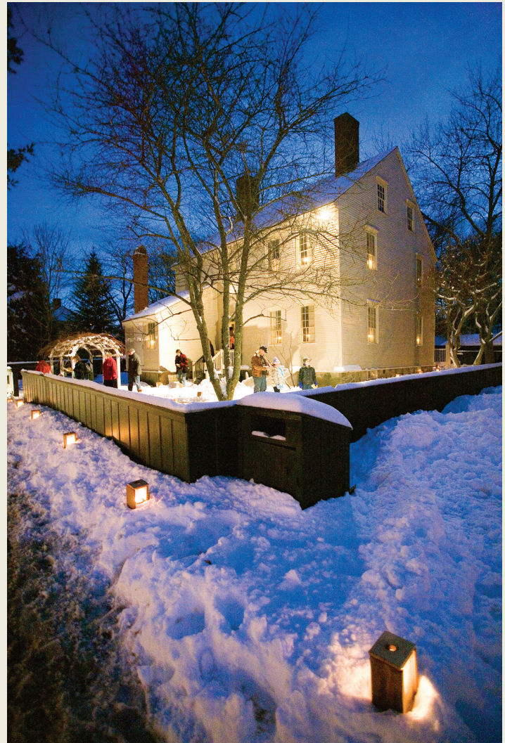
Candlelight Stroll Members House! Don't forget to stop by Walsh House for a special holiday welcome just for members.