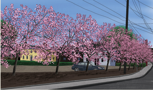
Rendering of the Vivian Baker Treat Garden

Just as the museum has worked to enhance the first impression made on visitors by implementing the Heritage House Program to preserve and rehabilitate 10 underutilized historic buildings in the collection, it is now time to address the landscape.